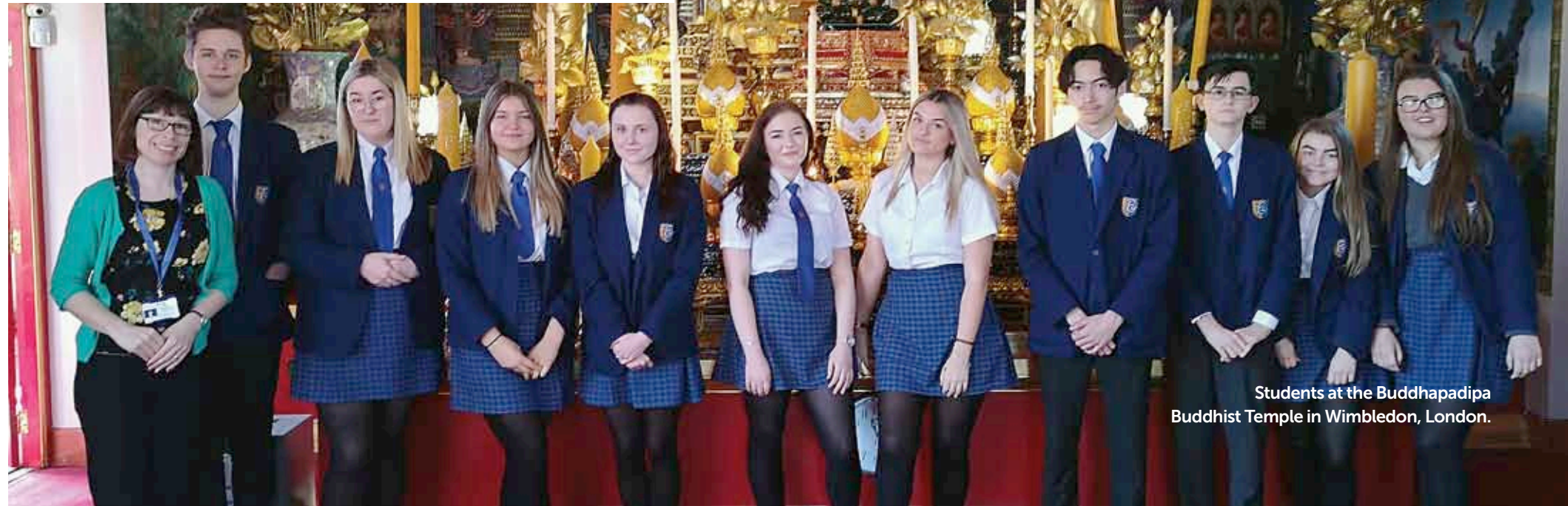
Students at the Buddhapadipa Buddhist Temple in Wimbledon, London.

At Aylesford we are open-minded and compassionate. Our students are encouraged to explore different cultures and views.