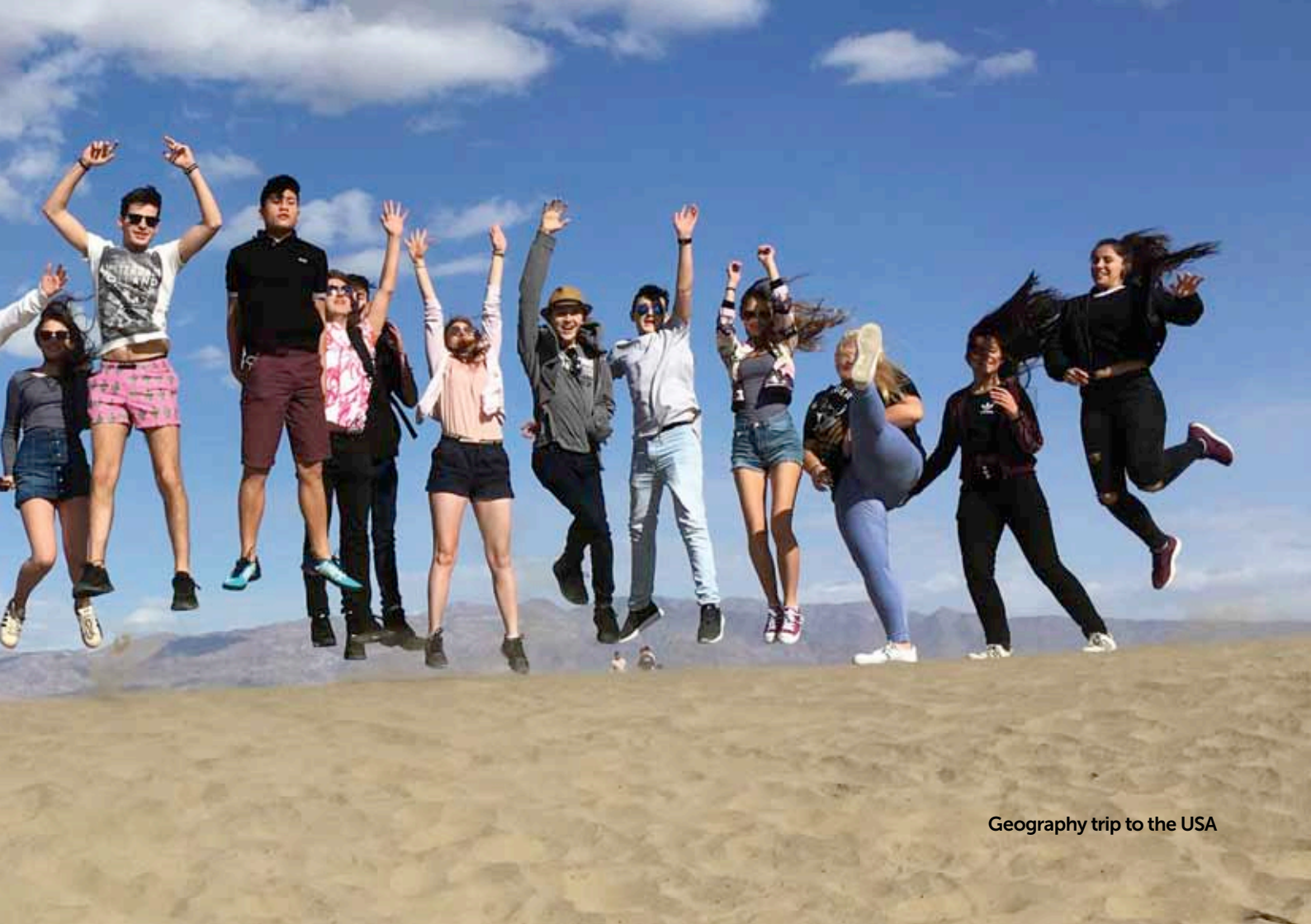
Geography trip to the USA