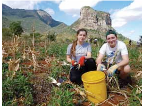
Students taking part in a Camps International visit and working to support local communities in Kenya through their own fundraising activity.